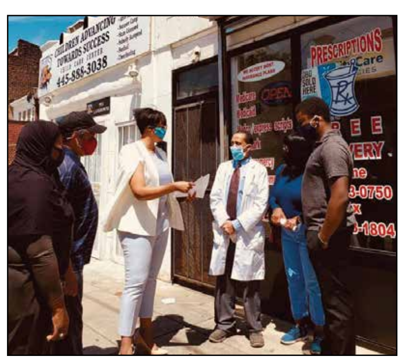
In my ongoing commitment to our business corridors, I spent time cleaning up and assessing the damage left behind to mom and pop shops and other local businesses impacted by civil unrest and COVID-19. I will continue to work to support businesses in the area and bring business resources to the district.

Continue to page 6 for details about the virtual events.